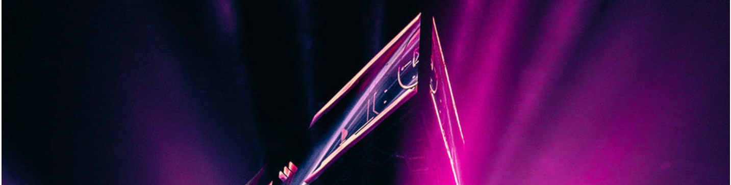
Valmar Plays Hard with Robe at Budapest Arena